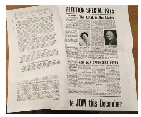
Our thanks to the Jersey Archive for locating copies of the original Jersey Democrat leaflets to provide inspiration.

In many ways Reform Jersey sees itself a successor organisation to those which came before it, and so it seemed appropriate to name their newsletter after the publication issued by the Jersey Democratic Movement.